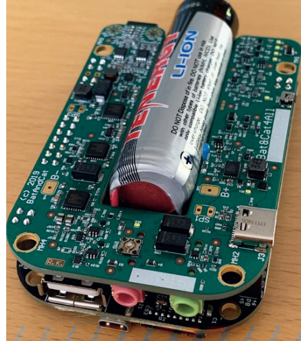
A prototype of USA-based BatAndCat's openMHApowered hearing aid and earpiece

At the Linux Audio conference they had a live coding concept at the Native Instruments headquarters in Berlin. There was a guy making the most intense, amazing music just sat at a laptop typing code. But then at the end people were like, "Is it finished?", and then he took his hands off the keyboard and... [rapturous applause noise]. It's a different performance style and I think people like the visual aspect.